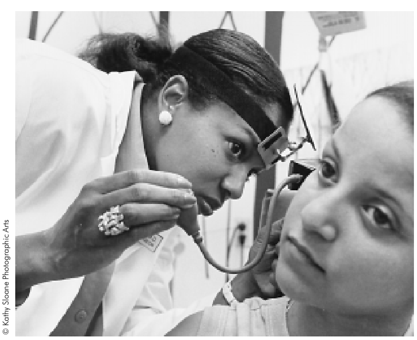
Physicans employ their extensive knowledge of biology and biochemistry in treating illness.