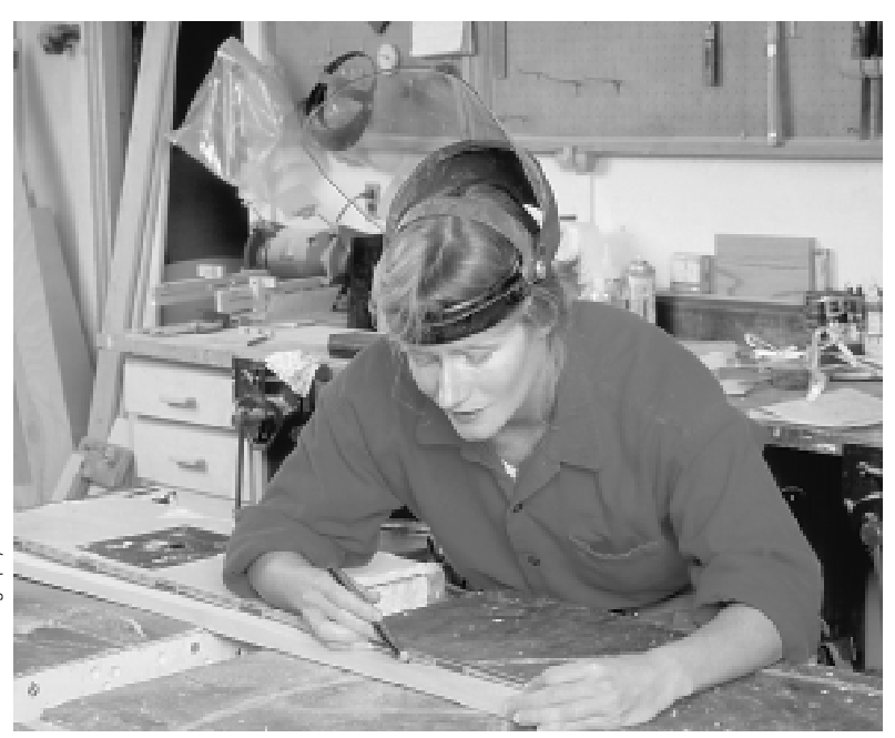
Carpenters use algebra and geometry to calculate the proper angles at which to cut building materials.