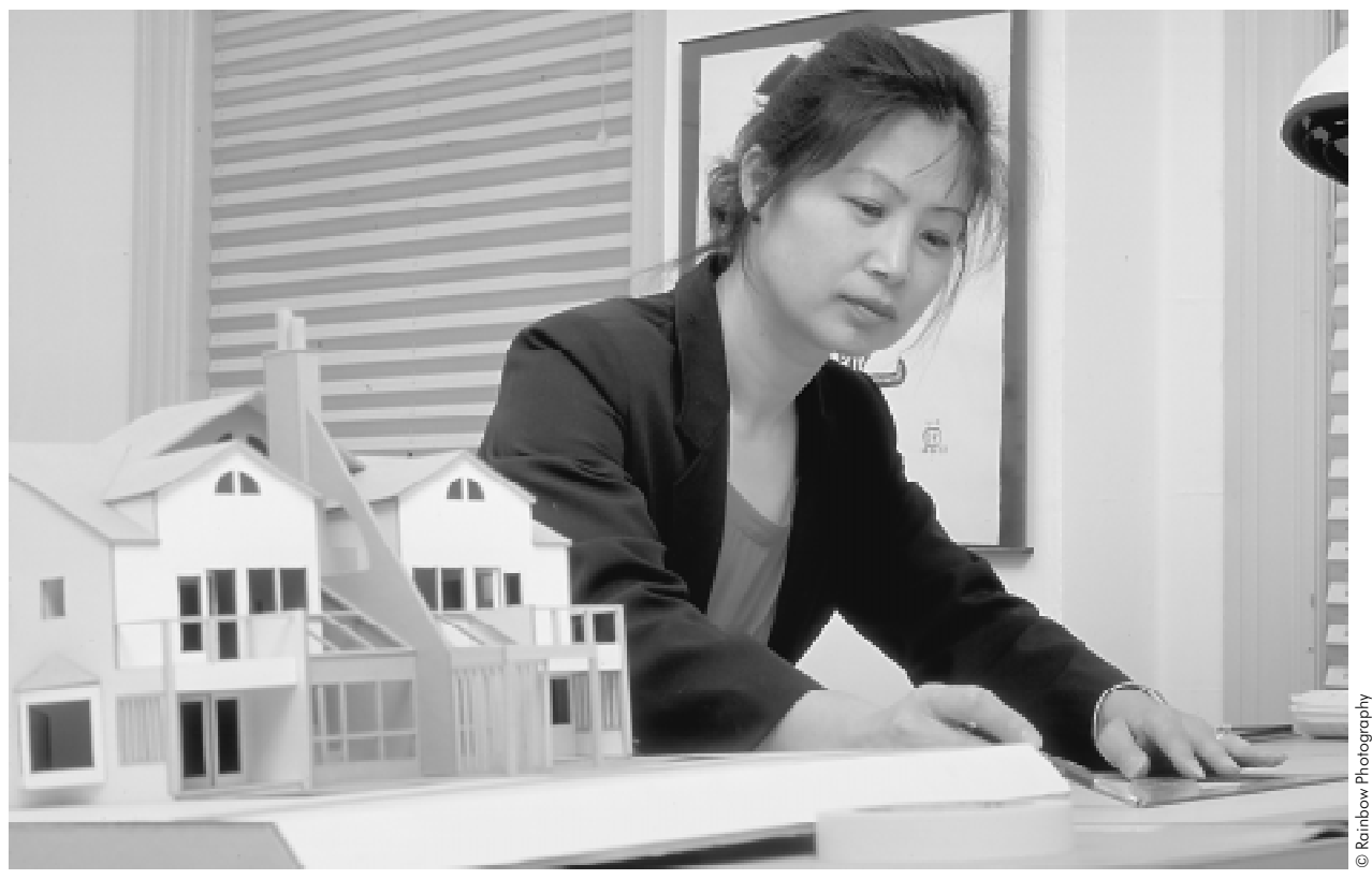
Architects must describe their designs to clients in terms they can understand.