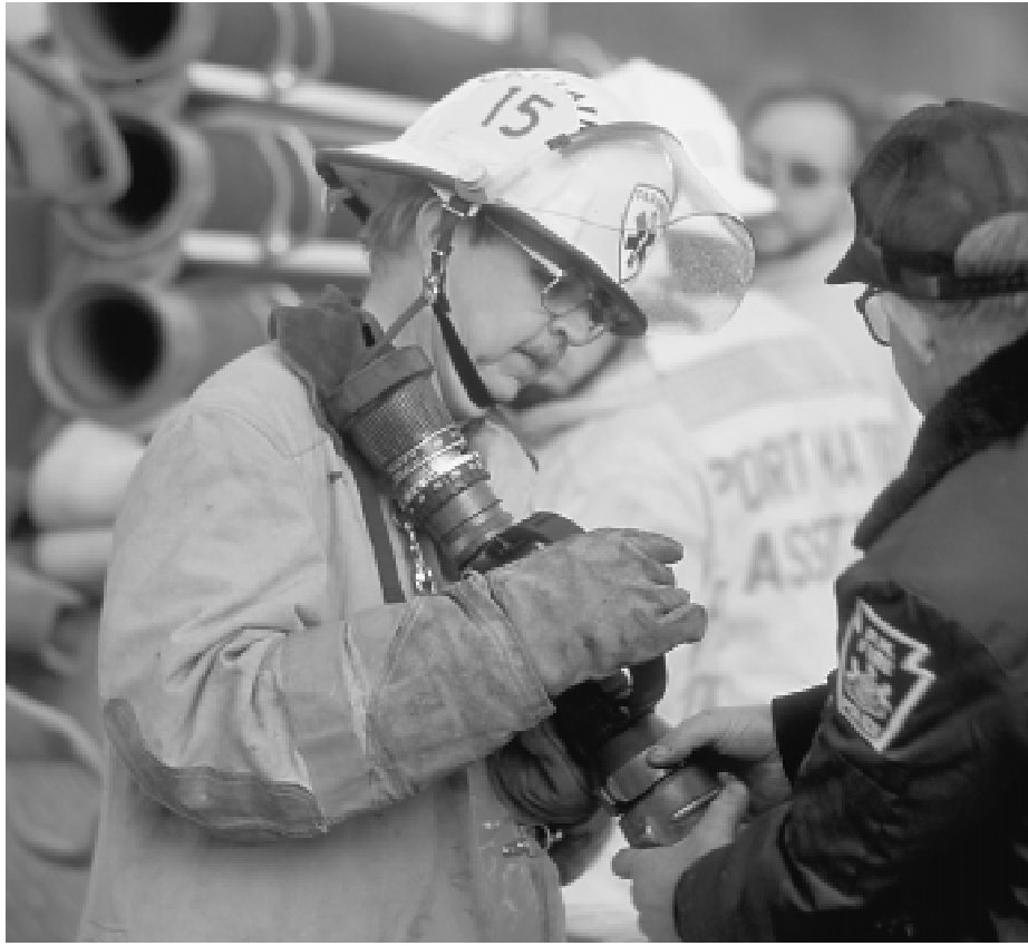
Understanding the physical properties of materials helps firefighters combat different types of fires.

Technicians and technologists. Science and engineering technicians carry out the plans of scientists and engineers—setting up experiments, recording results, or testing product quality. They may also design simple experiments. These workers use testing and measuring devices and have a solid understanding of laboratory techniques.