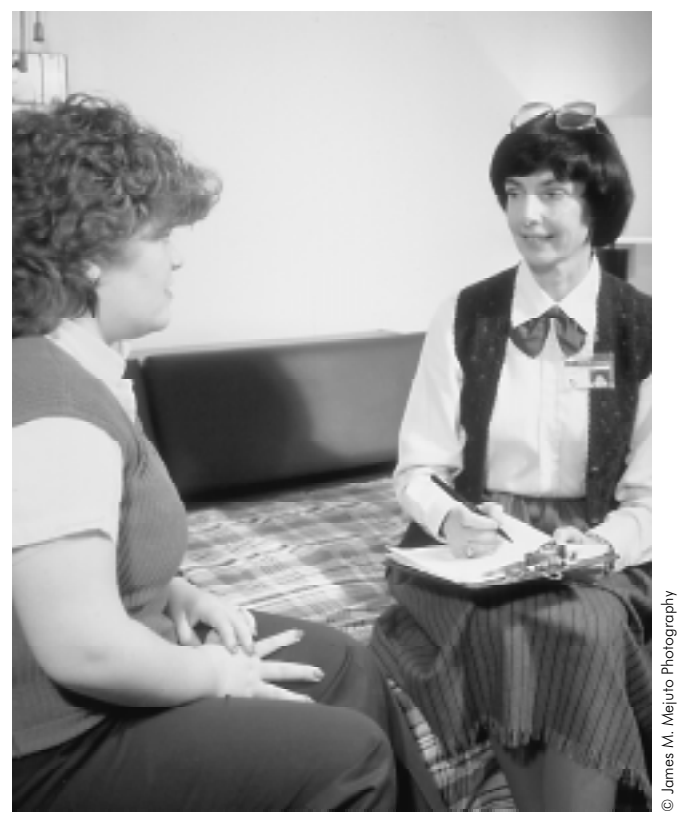
Social workers need excellent interpersonal skills to help clients cope with problems, such as disabling illness, substance abuse, financial crisis, unplanned pregnancy, and child or spousal abuse.