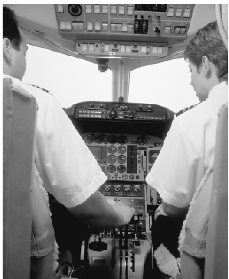
Pilots apply math and science whey they assess weather reports and create flight plans.