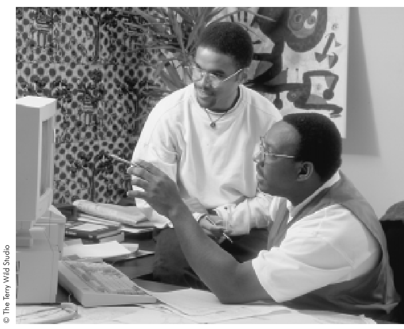
Economists, economics professors, and marketing research analysts describe economic and commercial activity using advanced statistical methods.