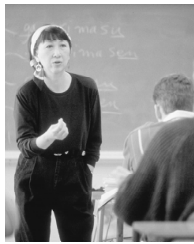
All teachers must communicate well with students. Teachers who instruct in a specific subject need expertise in that area.