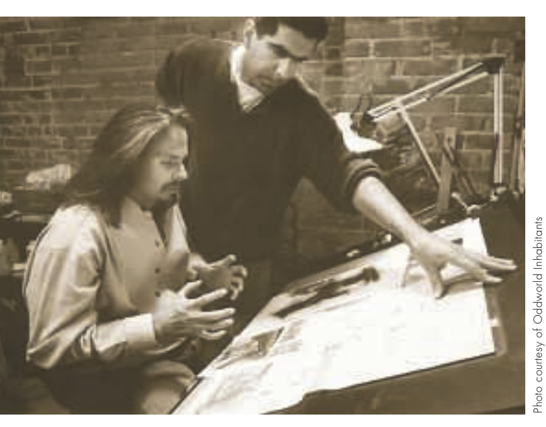
Concept artists draw storyboards to illustrate designers' ideas.

Texture artists take a photograph or paint a picture of a surface they need. Then, they scan it into the computer.