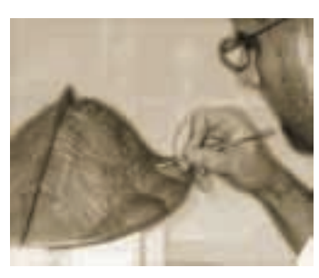
Some artists sculpt models for 3-D scanning.

Two techniques for creating and animating objects combine computer