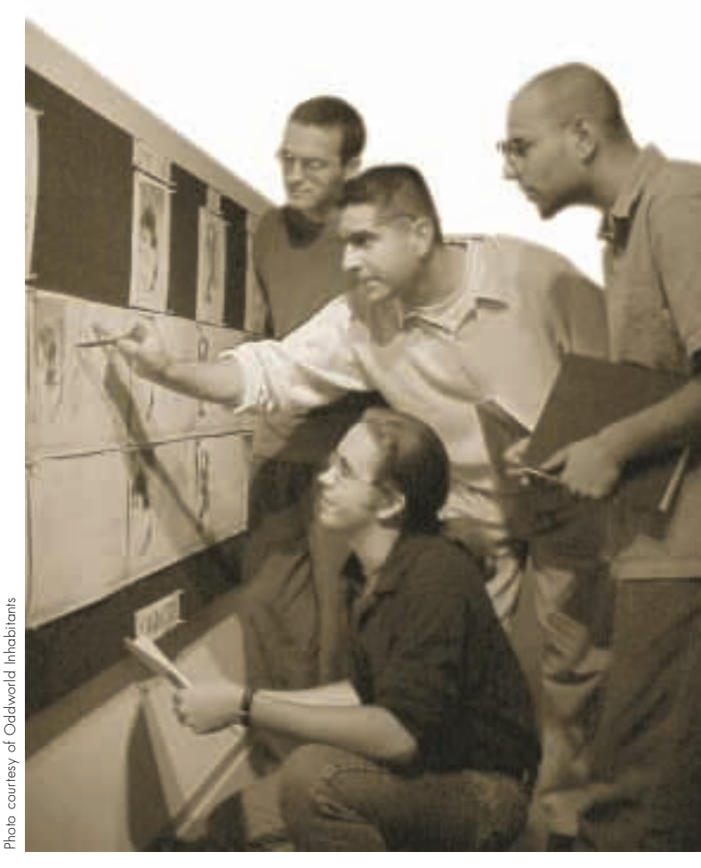
Because game developers work in teams, aspiring developers should try to get team-oriented experience.

When applying for jobs, candidates are expected to demonstrate their skill. Artists and sound designers compile short