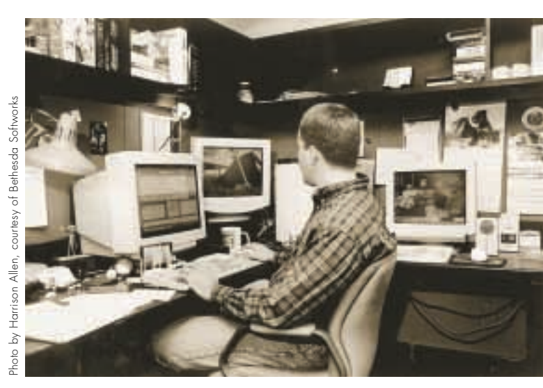
Developing strong math skills helps programmers describe a video game object's movement through space.

To make the development process easier, tool programmers tweak their tools and add helpful features. Other members of the team come to them with wish lists and suggestions.