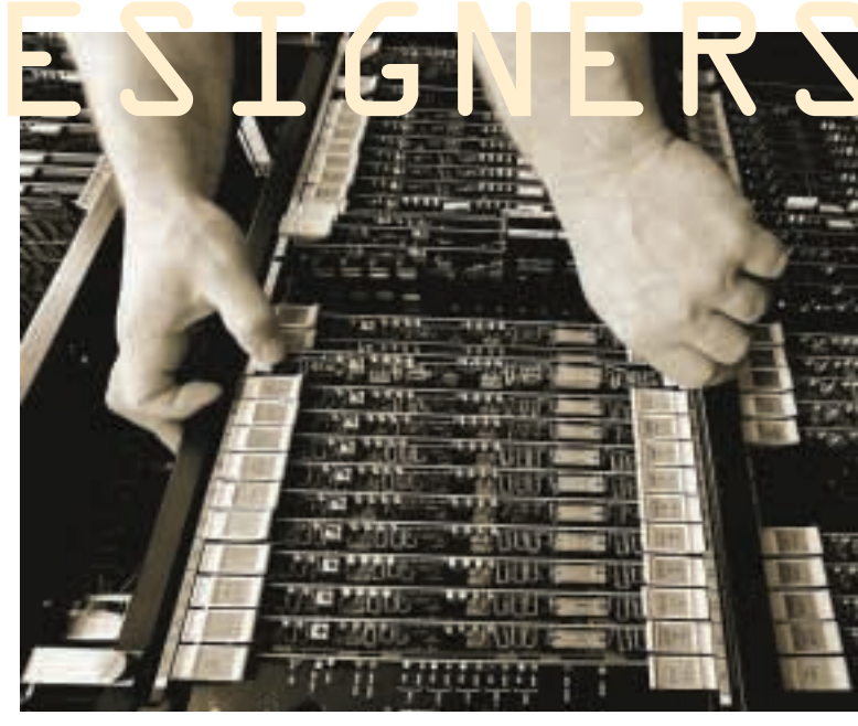
To create sound effects, sound designers modify an existing noise or find and record it themselves.

They balance realism with the entertainment value of exaggeration, routinely sweetening natural sounds for dramatic effect.