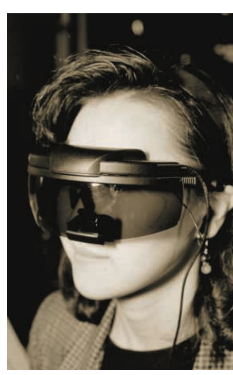
Testers identify problems in a video game before it is released to the public.

a game level that won't load. Other problems are with gameplay. "If you spend two hours getting past a monster and only earn two points, there's something wrong," says Nelson. Testers identify places that are too hard, too easy, or too confusing.