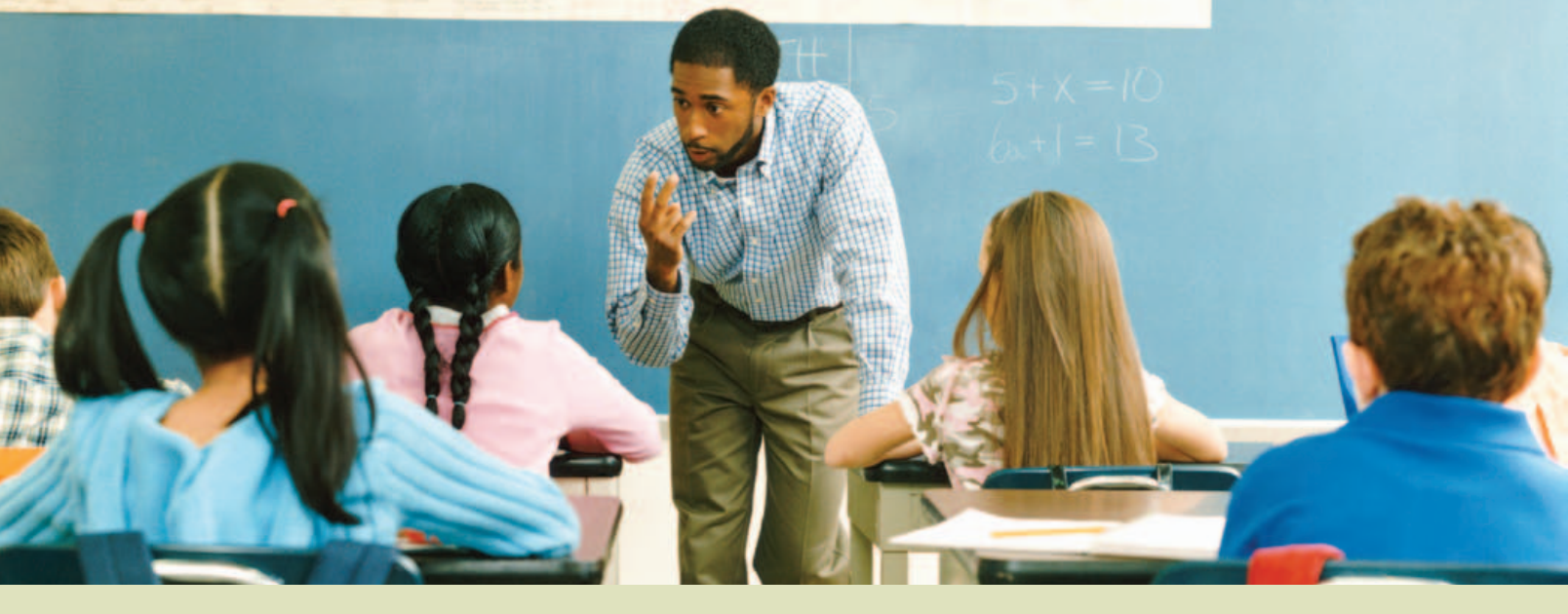
Serving, learning, and earning: