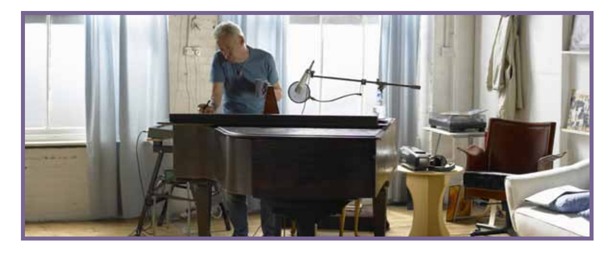
Composers write music that creates or complements a film's mood.

digitally edits it to complement the film footage.